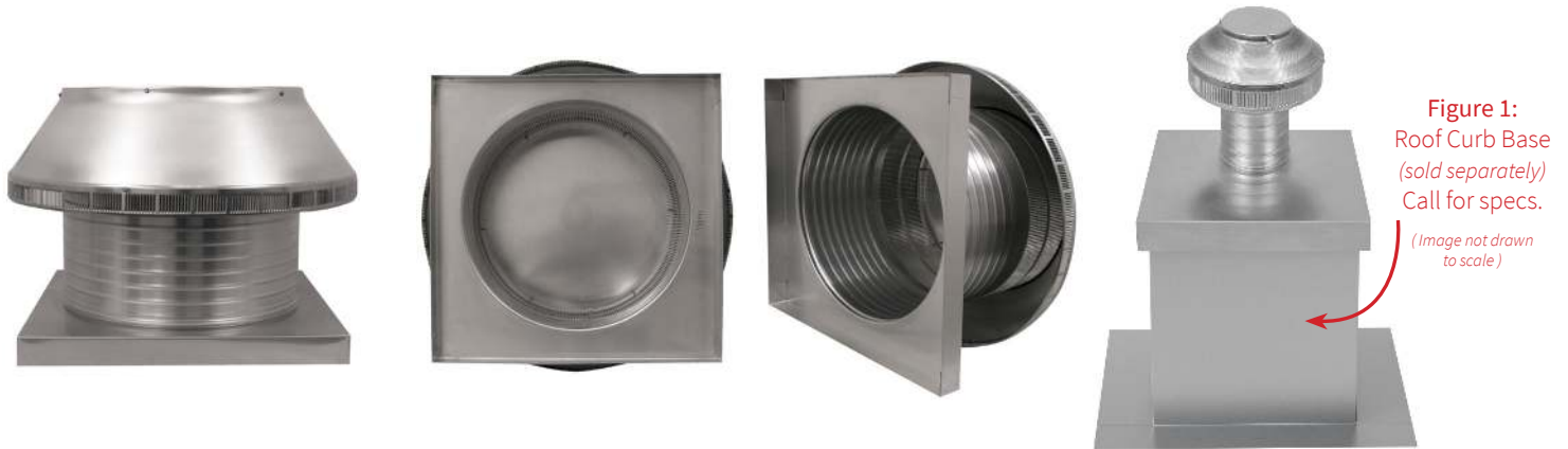
Figure 1: Roof Curb Base (sold separately) Call for specs.

A High Quality Roof Vent for Superior Attic Ventilation