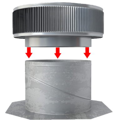
*Base not included

Note: All dimensions are within \pm 0.1" (2.54 mm)