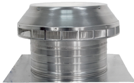
Colors are available