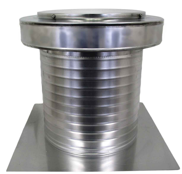
Keepa Vent - an Attic Roof Vent Model: KV-12 Diameter: 12"