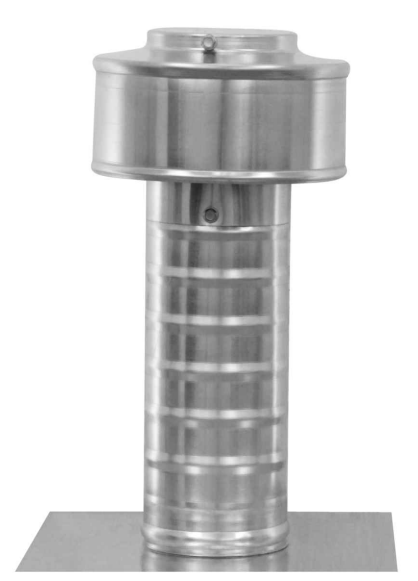
Keepa Vent - an Attic Roof Vent Model: KV-3 Diameter: 3"