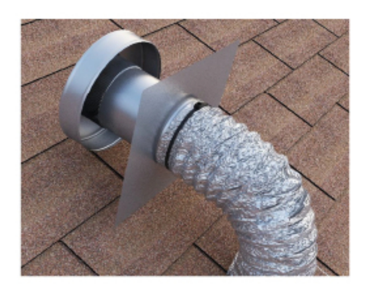
Step 7: Using a Zip Tie secure the Flex Duct to the Tail Pipe.