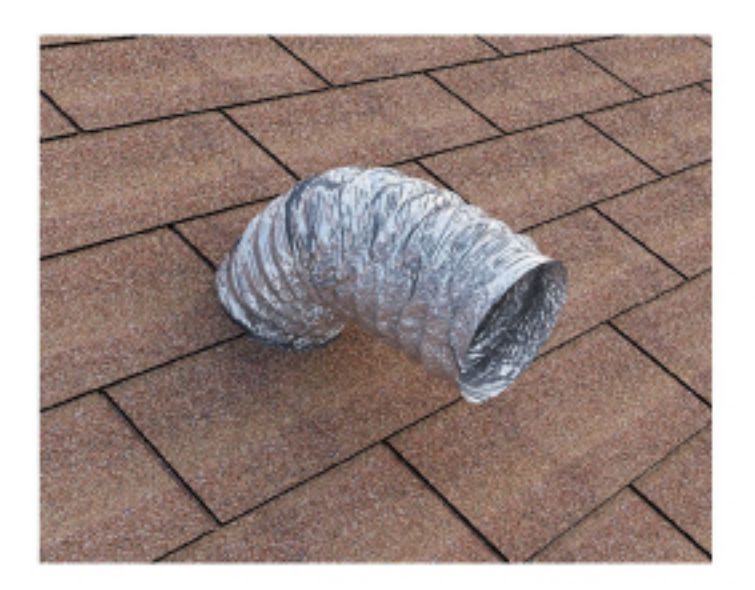
Step 7: Using a Zip Tie secure the Flex Duct to the Tail Pipe.