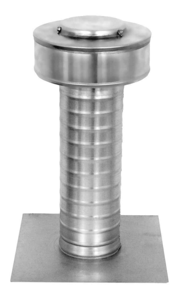
Keepa Vent - an Attic Roof Vent Model: KV-4 Diameter: 4"