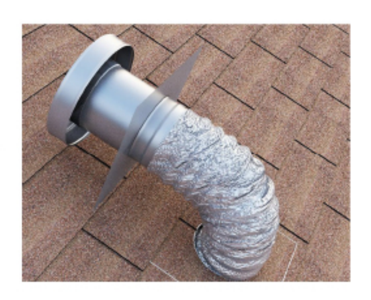
Step 8: Put roofing sealant on the underside along the bottom edge of falnge as shown