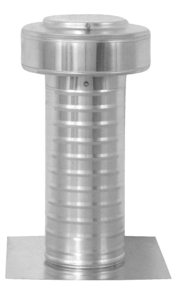
Keepa Vent - an Attic Roof Vent Model: KV-5 Diameter: 5"