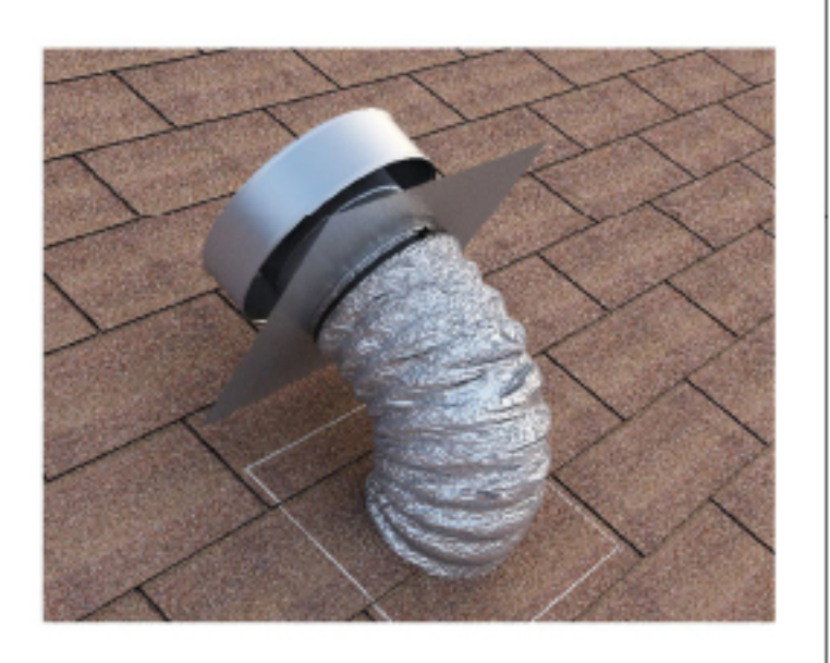
Step 7: Using a Zip Tie secure the Flex Duct to the Tail Pipe.