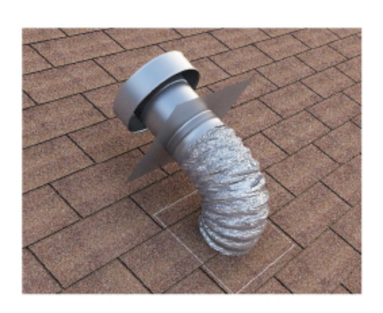
Step 6: Insert the bottom of the Tail Pipe to the flex duct.