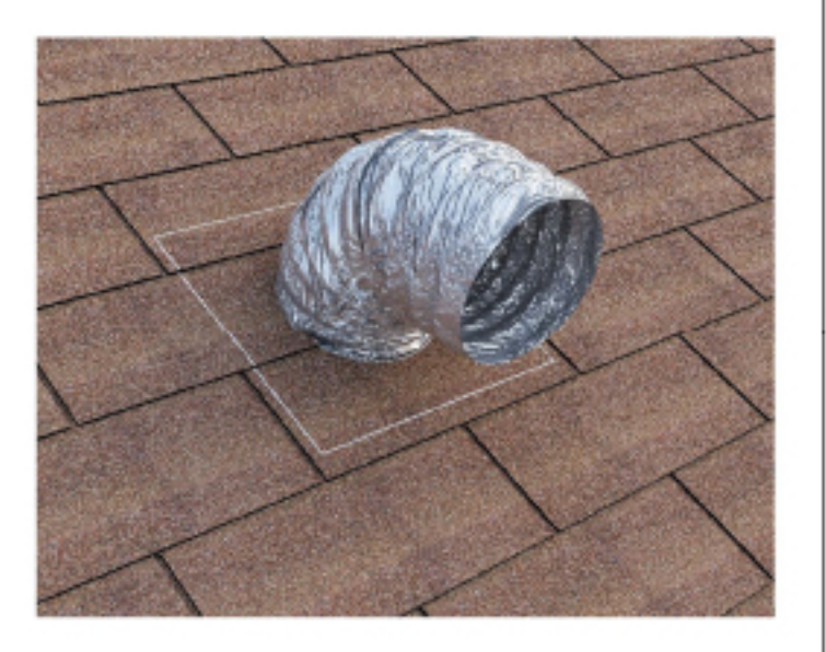
Step 5 : Once the hole is cut reach in the attic and pull up the duct through the hole.