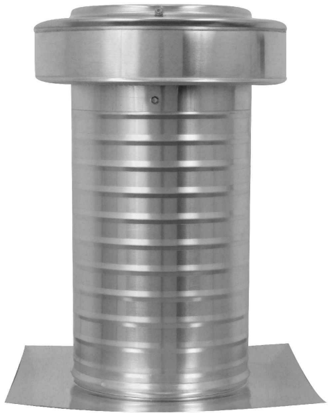
Keepa Vent - an Attic Roof Vent Model: KV-7 Diameter: 7"