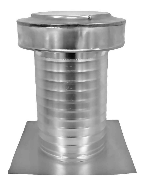
Keepa Vent - an Attic Roof Vent Model: KV-8 Diameter: 8"