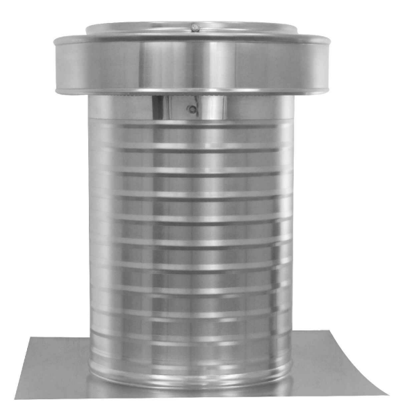
Keepa Vent - an Attic Roof Vent Model: KV-9 Diameter: 9"