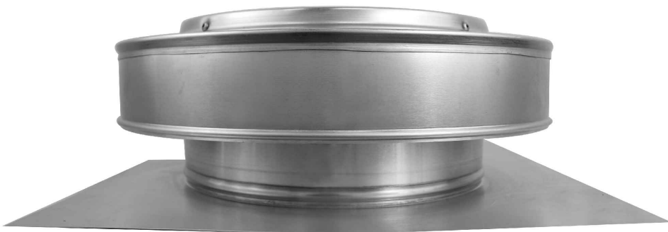
Round Back Roof Vent

Total number of screws needed = 12 (screws not included)