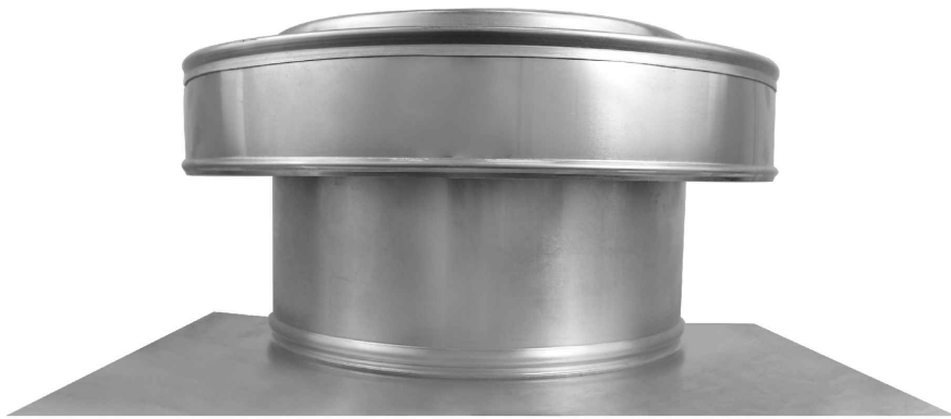
Round Back Roof Vent

Total number of screws needed = 12 (screws not included)